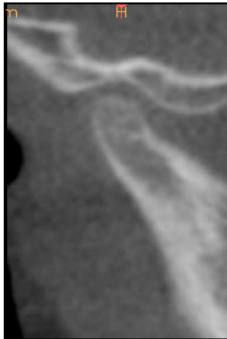
Fig. 1: “SS”—T 0 scan pre-treatment (cropped)

teeth in contact has proven to be a successful method of assessment for appliance removal with the least incidence of relapse.