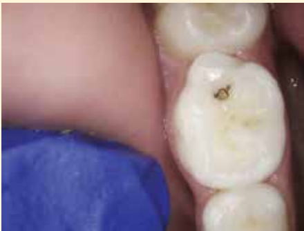
Child's first cavity.

In each of these cases, the patient or the parent of the patient was skeptical about the diagnosis until images from the CS 1500 were shown.