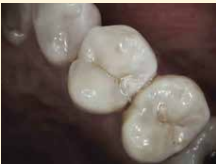
Decay that was visible radiographically, but not clinically, until the tooth was drilled.