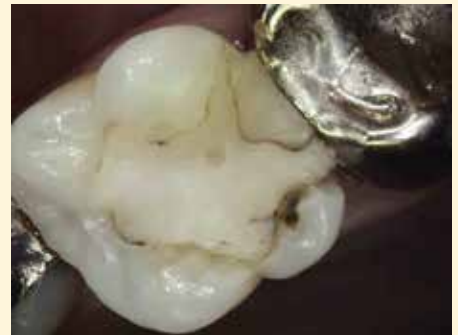
Decay around a filling that had been recently done at another office.