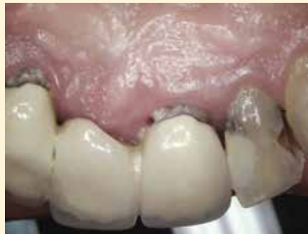
Decay on the lingual side under the bridge.