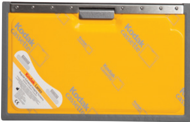
Our premium cassette