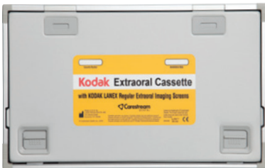
Our new value cassette