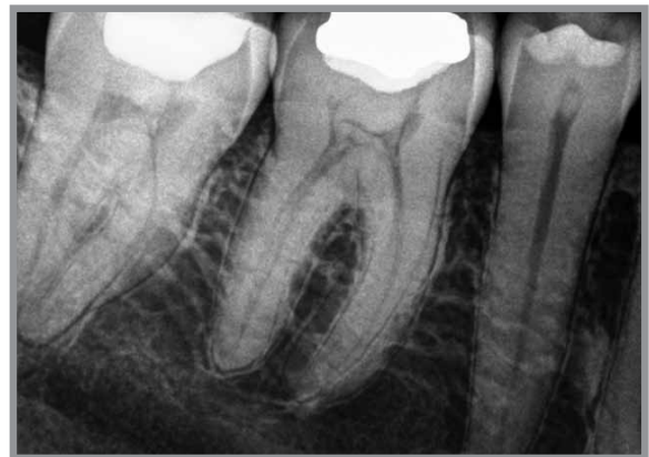
Periapical radiograph from the RVG 6100 system

Ready to bring your practice to the leading edge? Windent practice management software and Kodak dental imaging software have combined to deliver exceptional gains in productivity and clinical planning.