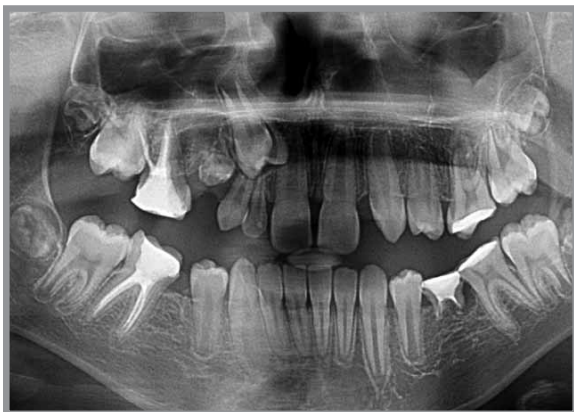
Panoramic radiograph from the Kodak 9000 system

Versatile Kodak dental imaging software allows volumes to be saved to a disk and transferred with a fully-functional 3D viewing module so that other oral health professionals may manipulate the images to focus on specific regions of interest.