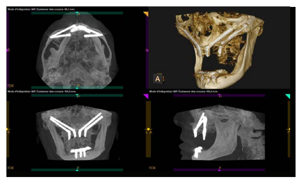
Zygomatic implants case using large field of view (16 cm x 12 cm)