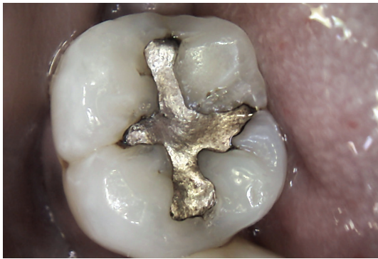
Visualize the smallest details with crystal-clear views and true-to-life colors.