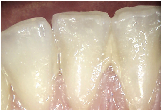
High-resolution images reveal even the tiniest details.